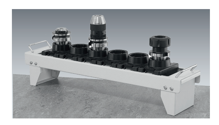
Dimensions (mm) - 590 wide x 125 deep x 110 high