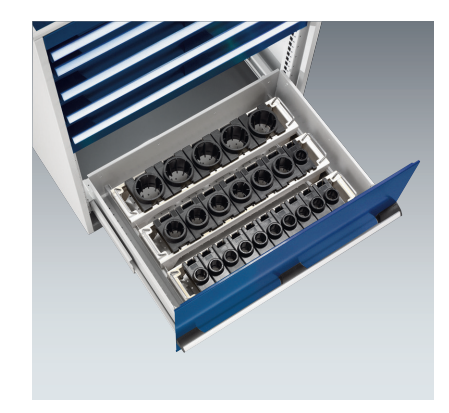
800mm x 650mm cabinet with carrier brackets.