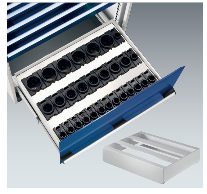
Empty drawer frame - add required inserts.

Any combination of CNC inserts may be used together in a single row up to the maximum number of sections per row.