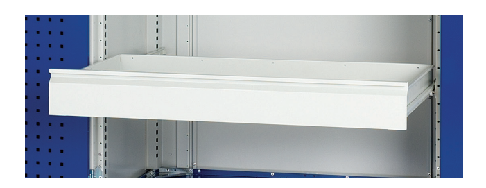
125mm or 175mm high drawers with 75kg U.D.L. capacity on smooth action roller bearing slides. Adjustable on a 25mm vertical pitch.