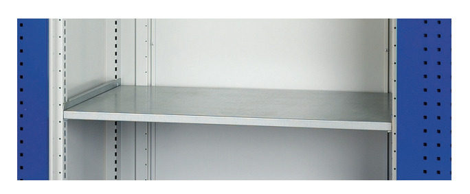
Durable, scuff resistant galvanised steel shelves, 100kg U.D.L. capacity. Adjustable on 25mm pitch.