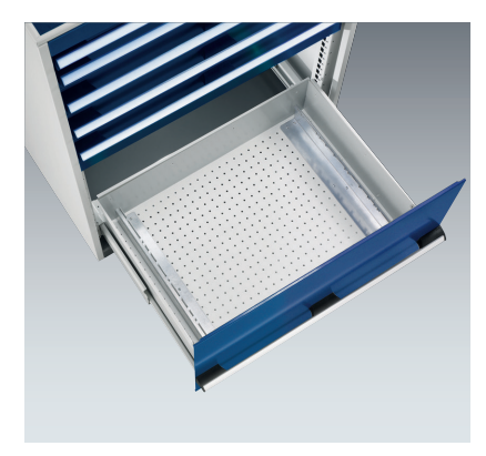
Carriers locate onto the drawer brackets.